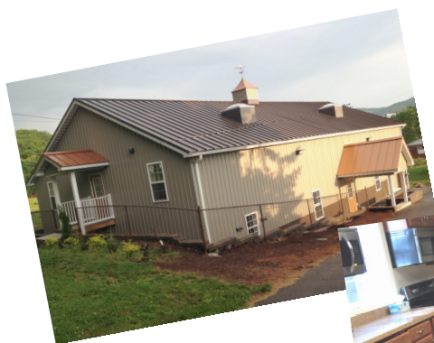
Dedication to God's purposes planned for June 5, 2016