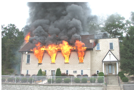
Corinthian Center destroyed by fire in August 2010

It's been a long road, we've learned a lot about each other and our church, and God has been faithful in our journey! This is not an ending, but a beginning of new possibilities for ministry to our neighbors.