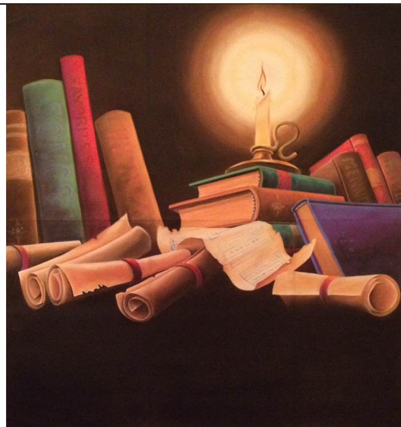
Artwork by Terry Rotruck

"In Christ's body we're all connected to each other..." Eph 4:25, The Message