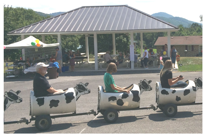
They let just anybody ride this train!